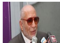
Khodeiri denies NAC internal rifts after MB dialogue